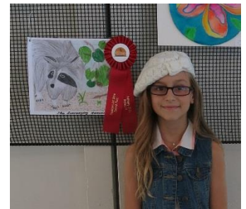
Second Place 3 rd -5 th Avia Chickk