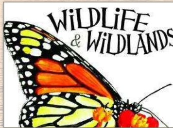
Annual Art Show

Participate in the production of our annual events – or simply come and enjoy! Don't miss the Nature Festival , a day of activities for families with opportunities for creative expression and learning; Wildlife & Wildlands Art Show – an event showcasing the natural and cultural resources of Florida through artistic expression; Children's Art Show , and more, all in a pristine, natural environment.