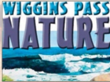
Annual Nature Festival