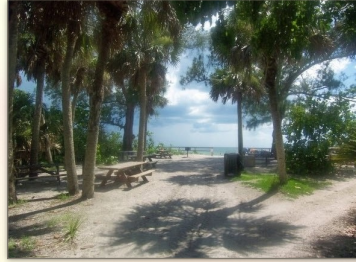
Picnic tables and BBQs