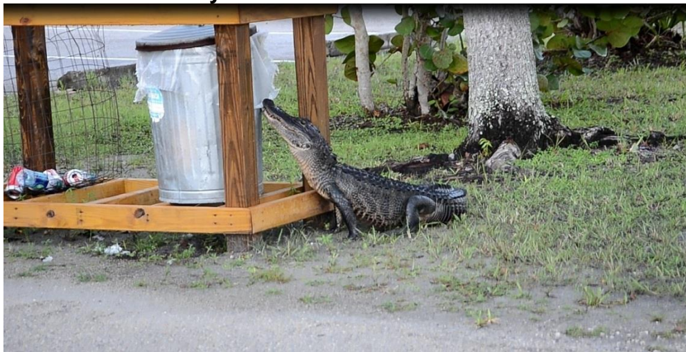
Taken at Collier-Seminole State Park