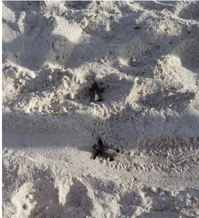
Baby Loggerhead sea turtles

As of today, our sea turtle nests are holding at 58. We've had 39 out of the 58 nests hatch so far!