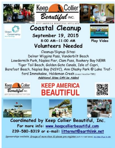
Flyer for Coastal Clean-up