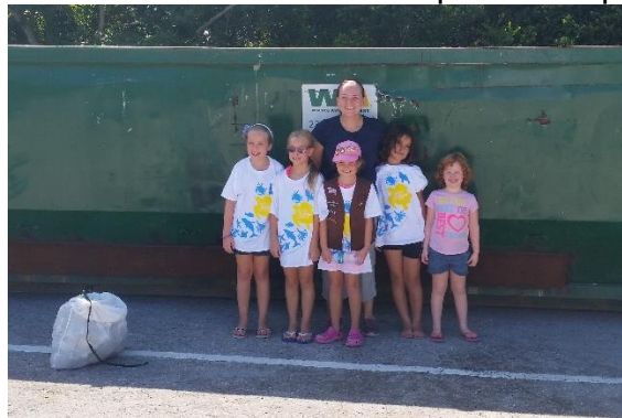
Volunteers dropping off trash bags

On Saturday, September 17, Delnor-Wiggins Pass State Park was again a host site for Keep Collier Beautiful's annual Coastal Clean-up. From 8am-11am, 210 volunteers picked up trash all over the park and beach. Thank you to all the volunteers that helped to keep our park looking beautiful!