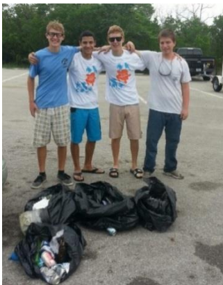
Volunteers at Coastal Clean-up