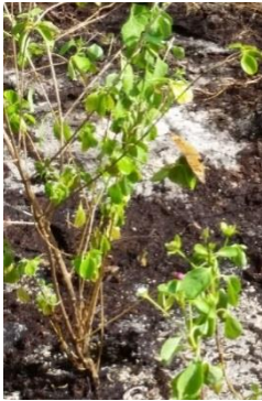
Common Buckeye butterfly on White Lantana

Many months ago, volunteers and staff removed dead Sea Grape trees from a section in Area 1. This left a large open space and many of us wondering what we should do with it. Soon the idea of the butterfly garden blossomed! Several volunteers spent many hours in the sun and heat removing the remaining dirt, roots, sticks, and weeds from the designated area. On September 26, a butterfly garden was born! Six volunteers spent the morning planting 50 native butterfly attracting plants; plants include Scorpion Tail, White Lantana, Horsemint (a.k.a Spotted Beebalm), Tropical Sage (red), and Blue Curls.