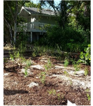
Finished butterfly garden in Area 1