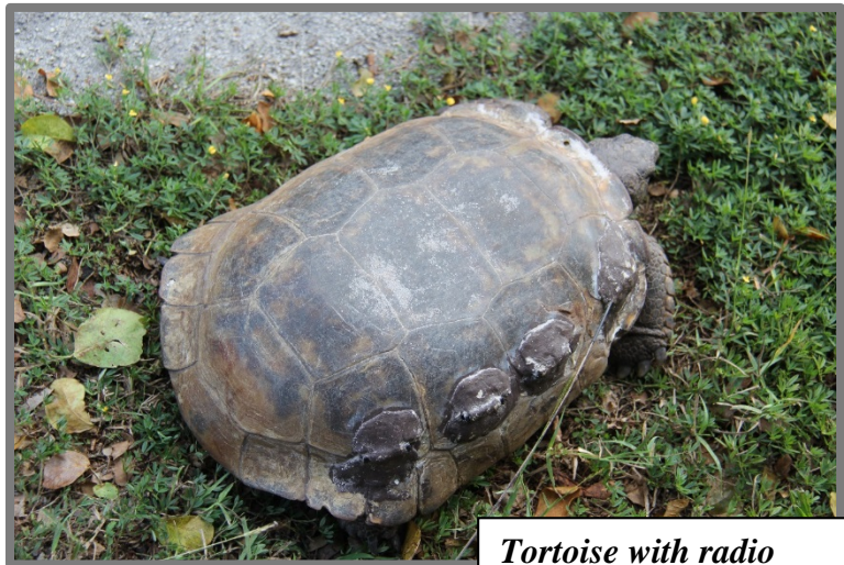
Tortoise with radio

Florida's coastal habitats are home to many threatened and endangered species that are under increasing pressure of habitat loss resulting from human development in the region. The Gopher Tortoise ( Gopherus polyphemus ) is one such species that is dependent on coastal dune and pine flatwoods habitats. Unfortunately, wildlife managers have very little