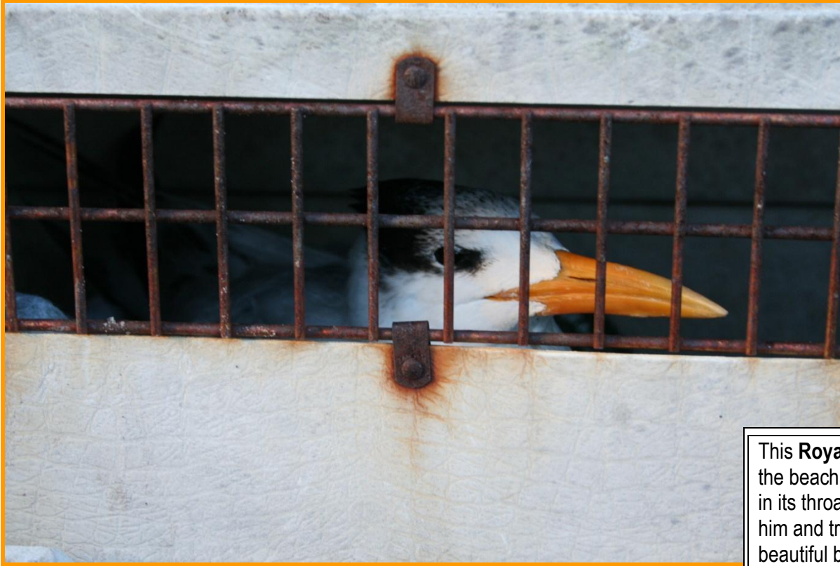
This Royal Tern found on the beach with a fishing hook in its throat. Rangers rescued him and transported the beautiful bird to the Conservancy where it will receive the proper medical attention.