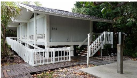
Bath House 2

A BIG thank you to volunteer Joe Spallone! He has been doing a lot of trimming in the park this fall. We've had a lot of growth this summer due to the heavy rains and much of the park has over grown into the parking lots and road.