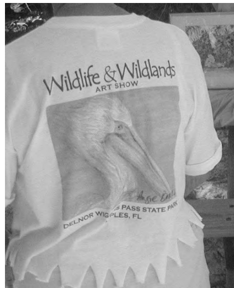
Art and BJ set off a fashion trend with this new "Jaws" inspired take on the t-shirt.